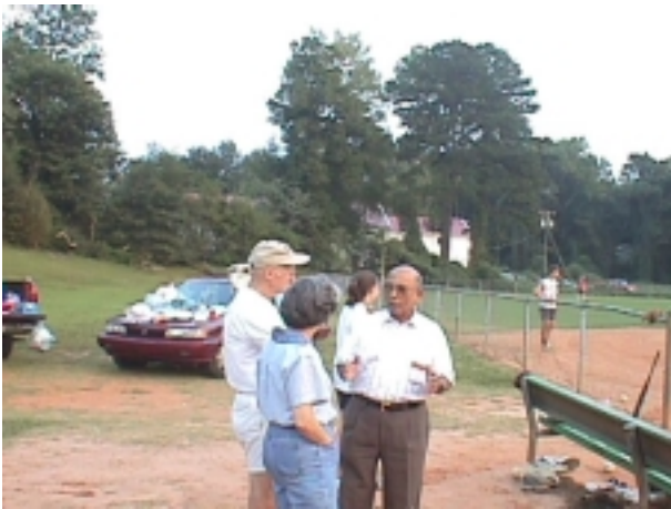
A couple of non-participating Section members.