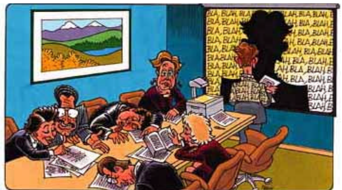
Illustration by: Klaus Ravn